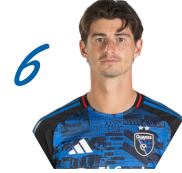
Ian Harkes @harksey23