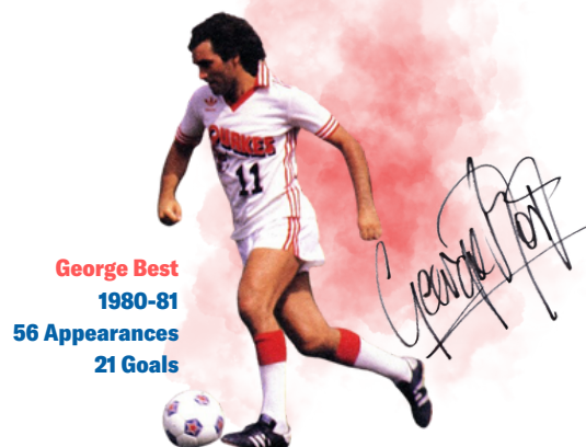
George Best 1980-81 56 Appearances 21 Goals

Primary Reference: San Jose Earthquakes Secondary Reference: Earthquakes, Quakes, San Jose, Black & Blue Founded: 1974 Stadium: PayPal Park MLS Cup: 2001, 2003 Supporters' Shield: 2005, 2012