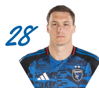
Benji Kikanovic @benjoo18