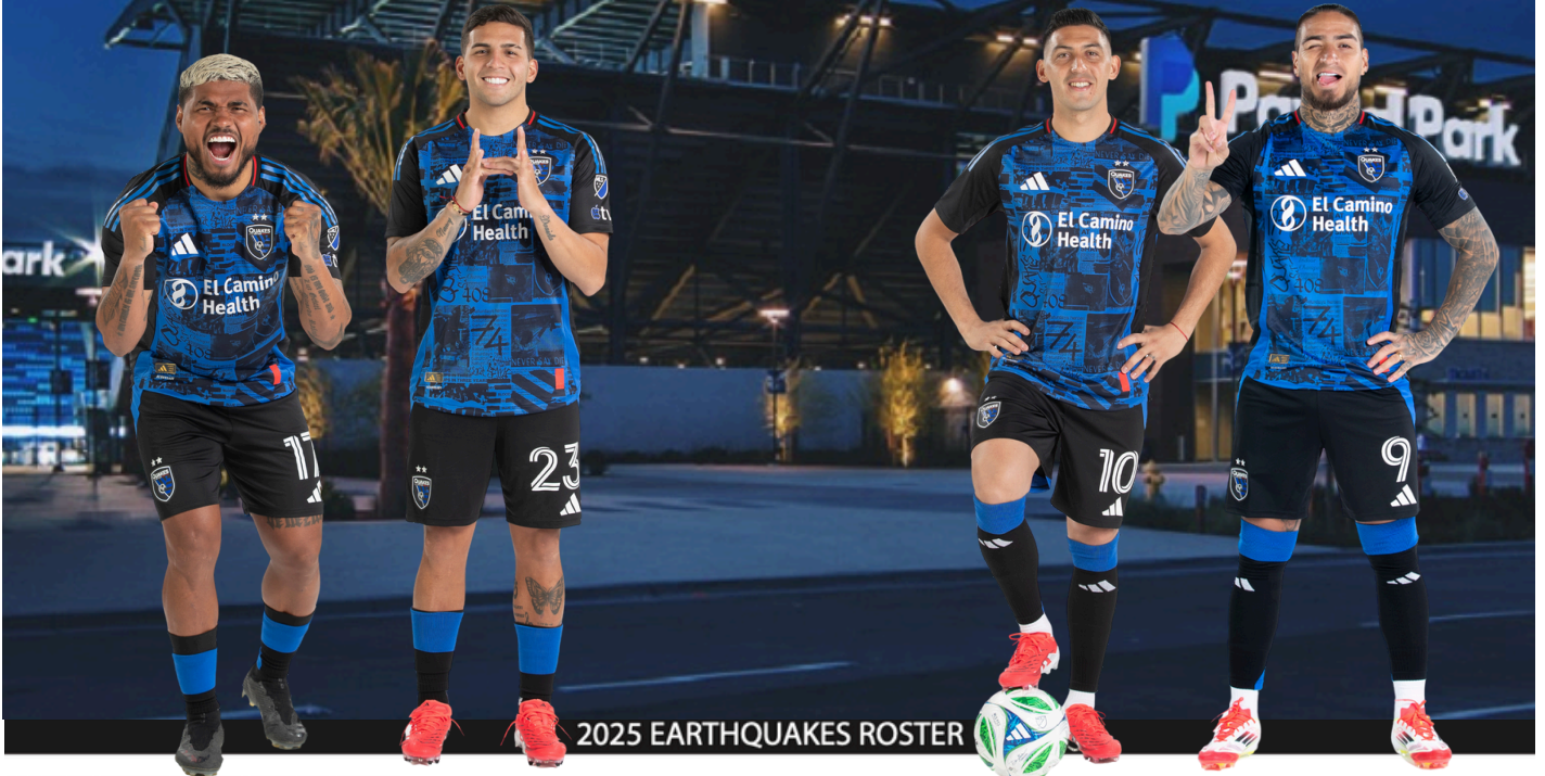
2025 EARTHQUAKES ROSTER